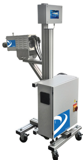
Dynisco ViscoIndicator Online Rheometer