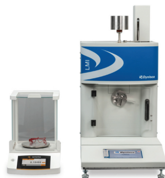
Dynisco LMI- Melt Flow Indexer with scale