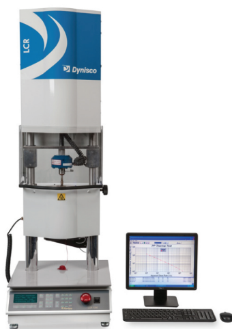
Dynisco LCR- Capillary Rheometer with Labkars software